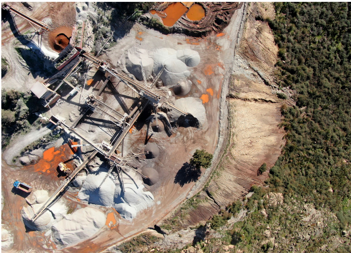
Aerial image of crushing and washing of gravel iron ore at a quarry in Felgar, Municipality of Torre de Moncorvo, Portugal